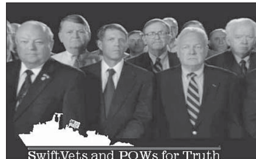
One of many Swift Vet television commercials featured in the $26 million grassroots advertising and personal testimony campaign.

Special thanks to Eagle Publishing, Inc. for donating copies of the book, Unfit for Command: Swift Boat Veterans Speak Out Against John Kerry , by John E. O'Neill and Jerome R. Corsi.