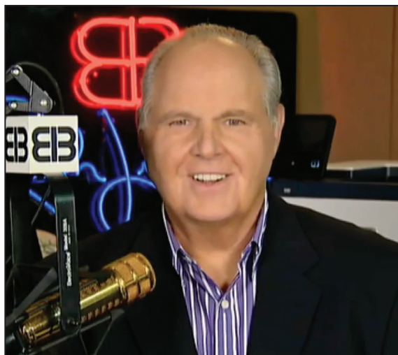
Rush H. Limbaugh III (01/12/1951- 02/17/2021) "The Greatest of All Time" and beloved friend of L. Brent Bozell III and the Media Research Center