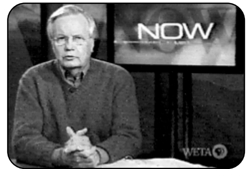
PBS's Bill Moyers won the "Quote of the Year" for a hateful, long-winded blast at conservatives.

The Best NQ is an annual compilation of the worst statements made by supposedly objective journalists over the past year. A panel of 52 judges from around the country selected the "winners." The panel included prominent journalists and commentators such as Kate O'Beirne, Robert Novak, Michael Reagan, William Rusher and Cal Thomas. The "Quote of the Year" came from former Lyndon Johnson aide and current PBS host Bill Moyers, who delivered this angry – and taxpayer funded – diatribe after the Republican victory in November.