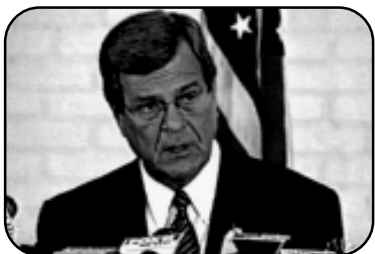
The contrasting coverage of Sen. Trent Lott (R-Miss.) and Sen. Patty Murray (D-Wash.) proved once again that the media have different rules for conservatives and liberals.