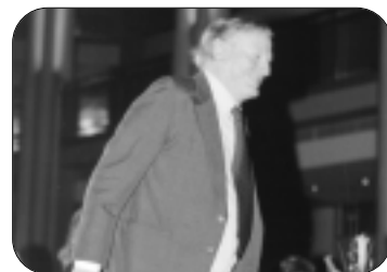
William F. Buckley, Jr.