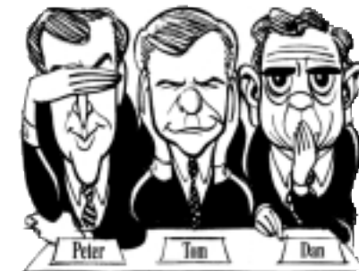
See no balance. Hear no balance. Speak no balance.

C-SPAN also provided an opportunity for many MRC members to see the MRC in action. I know many of you who were unable to join us in Washington watched the C-SPAN presentation and got a first-