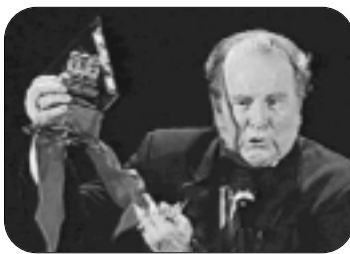
Hon. Bob Dornan

"I can say the Pentagon got hit, I can say this is what their position is, this is what our position is, but for me to take a position this was right or wrong, I mean, that's perhaps for me in my private life, perhaps it's for me dealing with my loved ones, perhaps it's for my minister at