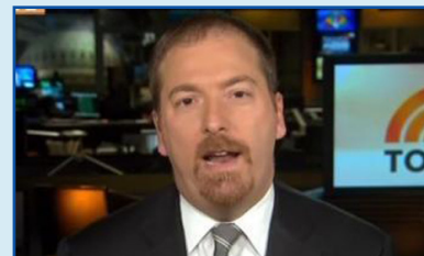
NBC's left-wing Chuck Todd smeared Arizona conservatives as "cranky retirees" and "people on the witness protection program."

■ NBC's Chuck Todd smears Arizona conservatives' support for a bill to protect religious liberty: "These people have been in the sun too long. Maybe it's frying in the head. Just cranky retirees and people on the witness protection program, that's who's left in Arizona?" ■ CNN's Candy Crowley reveals her obvious bias, "How do they solve a problem like Ted Cruz in the Republican caucus in the Senate?" ■ Meanwhile, MSNBC's Chris Matthews drones, "To Ted Cruz of Texas, government shutdowns and debt ceiling defaults are all in a day's work." ■ Former NBC anchor Tom Brokaw ridicules freedom: "In Korea, Cuba, Vietnam, and space, the U.S. spared little to defeat communism — at times, it seemed like a national obsession." ■ CNN's Brian Stelter shows why people don't believe CNN, "Some stories don't have two sides. Some stories are simply true. There's no necessity to give equal time to the quote-unquote 'other side.' One of these is climate change." ■ ABC's Barbara Walters throws another hard ball to Joe Biden, "I don't think there's much doubt that you're a superb Vice President." ■ MSNBC's ever-unbalanced Mika Brzezinski dissects GOP reminders about President Clinton's mistreatment of women: "Any Republican who is dredging this up is a misogynistic sexist hypocrite." ■ Finally, a voice of sanity in the wilderness, Charles Krauthammer quips, "This idea of austerity, you know, we have talked about Obama's assaulting the Constitution. This is an assault on the dictionary."