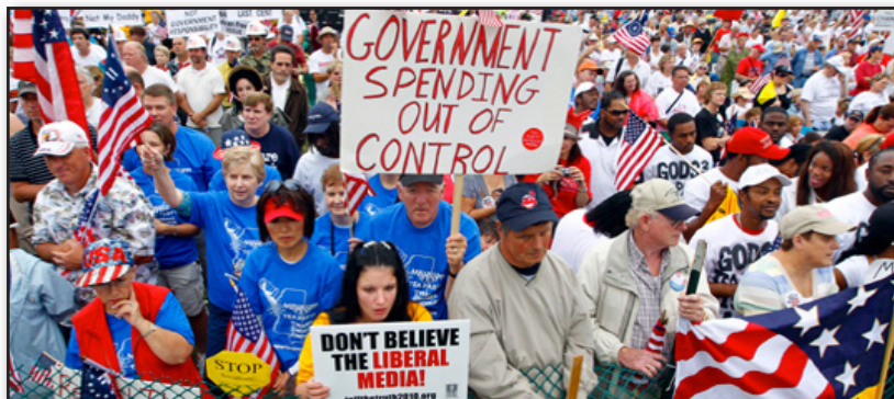
The Tea Party movement, which led to a GOP takeover in the House in 2010, turned five in late February but ABC and CBS said nothing while NBC gave the anniversary 10 seconds of coverage.

When the Tea Party launched on Feb. 27, 2009, it held protests in more than 40 cities. At the five-year anniversary, a massive celebration was held in Washington, D.C., with speakers such as Sen. Rand Paul (R-Ky.), Sen. Ted Cruz (R-Texas), Rep. Michele Bachmann (R-Minn.) and talk-radio host Mark Levin. The leftist media regularly smear the Tea Party as "racist," "homophobic," "terrorists," and "wingnuts," but when it comes to straight reporting on a significant political event and national movement, the networks censored the news.