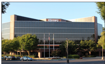
MRC Headquarters • Reston, VA